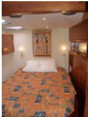
Starboard Aft Guest Cabin