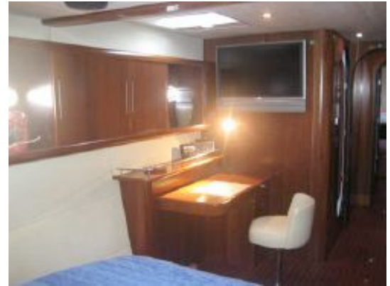
Port Aft Guest Cabin Desk