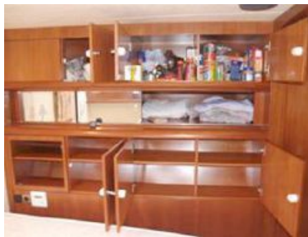
Starboard Aft Guest Cabin Storage