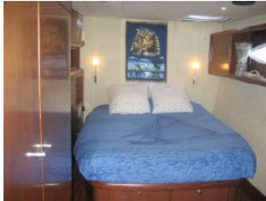
Port Aft Guest Cabin